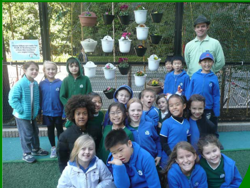
Finished! Students show off their new fence garden.