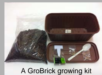
A GroBrick growing kit

Our food growing kits enable food to be grown on virtually any sunlit area: rooftops, verandahs, decks, driveways, patios, car parks, etc. And if you don't know how to grow food, we provide all necessary "hands-on" instruction, ongoing support, and a highly practical education program that will turn customers into urban gardeners within weeks.