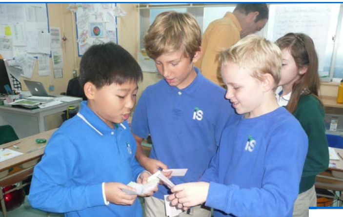
Students exchange barter coupons.